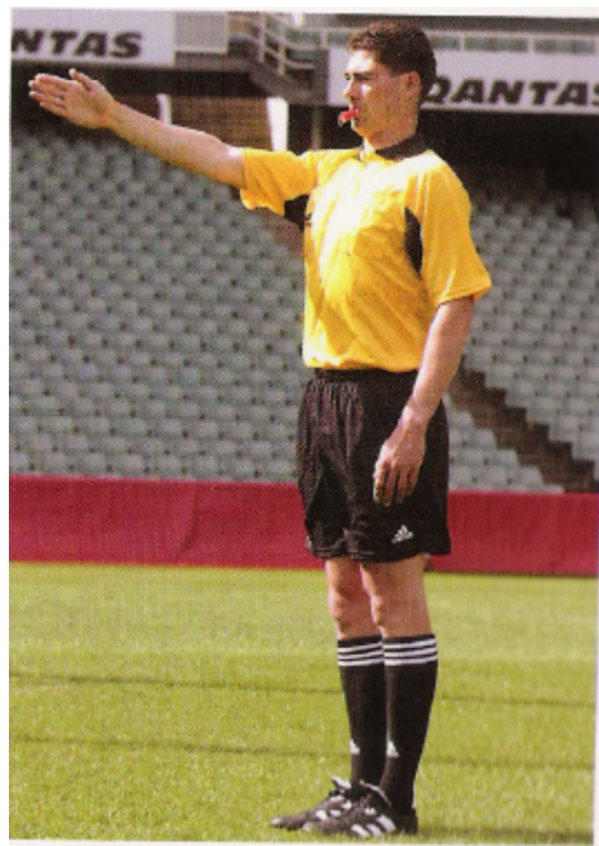
DIRECT FREE KICK Hand is horizontal and referee is pointing towards the direction of the kick to be taken.